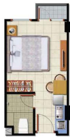
STUDIO A 21.25 m2