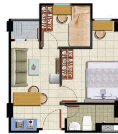
2 BEDROOMS C 38.68 m2