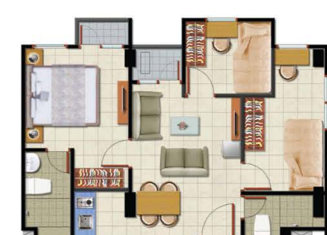
3 BEDROOMS A 60.09 m2