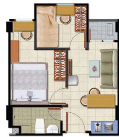
2 BEDROOMS A 37.21 m2