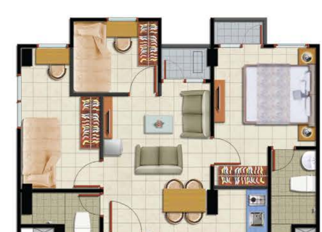
3 BEDROOMS B 59.93 m2