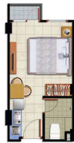
STUDIO B 21.15 m2